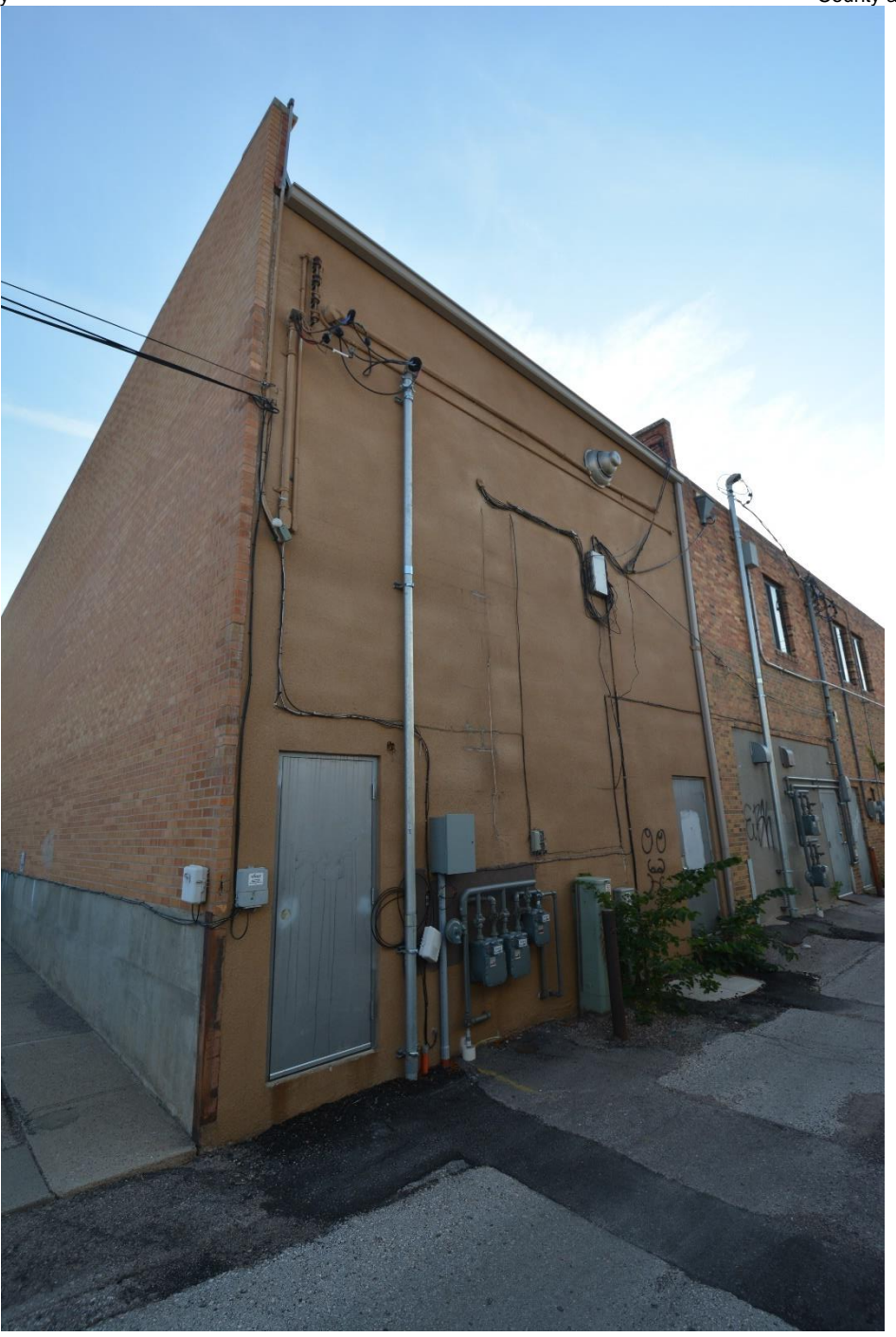
SD_PenningtonCounty_SouthDakotaStockgrowersAssociationBuilding_0004. Looking SW at the north elevation (rear).

Pennington County, South Dakota County and State