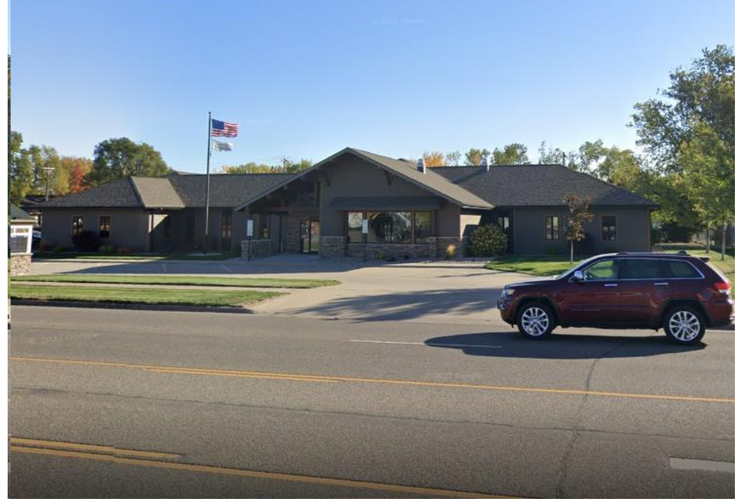
South Dakota Farmers Union Headquarters (current, Huron).

Pennington County, South Dakota County and State