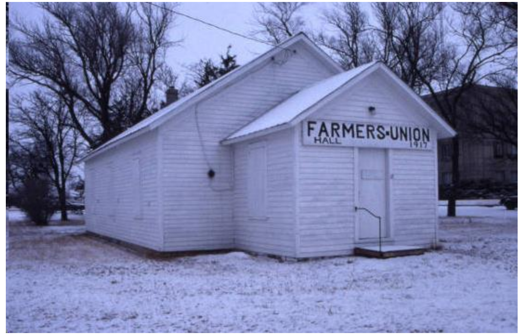
Farmers Union Hall (Plankinton).