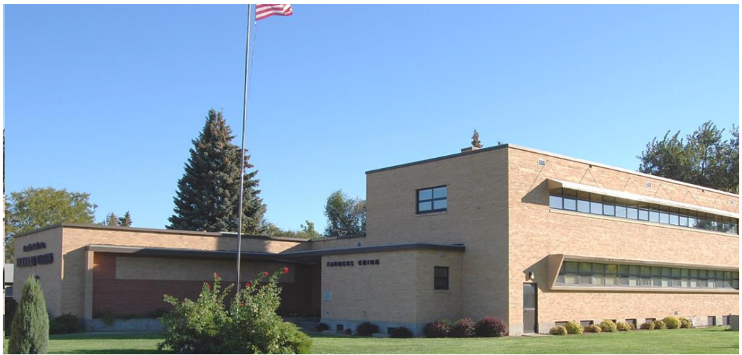
South Dakota Farmers Union Headquarters (Huron). Razed post-2007. (SD SHPO files)

growers organizations in South Dakota. The South Dakota Farmers Union headquarters was built in Huron in 1951. Architect Walter J. Dixon designed the two-story buff brick building with horizontal bands of windows and a flat roof. The building, which had been determined eligible for the National Register in 2007, has since been razed and replaced by a modern building at that location. A local Farmers Union Hall built in 1917 is in Plankinton. It is a gabled, wood-framed building clad in clapboard with a gabled entrance vestibule. It is located on the courthouse grounds and was likely relocated to this location for interpretation purposes. The building is also referenced as being the Firesteel Township Hall. Given the ambiguity surrounding the structure, no National Register determination has been made.