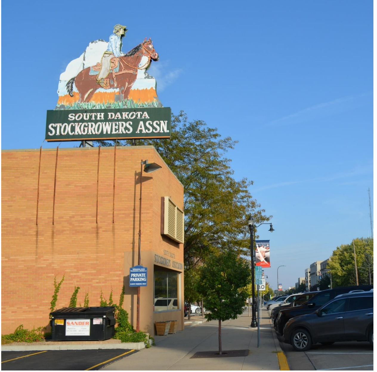
SD_PenningtonCounty_SouthDakotaStockgrowersAssociationBuilding_0001. Looking E down St. Joseph Street.

Pennington County, South Dakota County and State