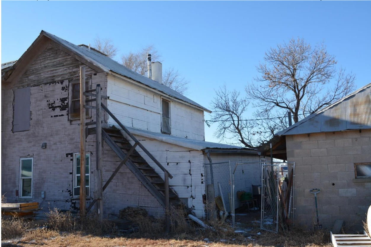
SD_HaakonCounty_StroppelHotelandHotMineralBaths_0015. Photo looking southwest at east and north elevations.