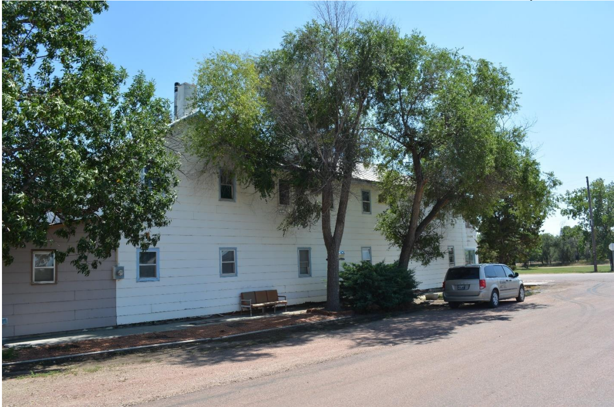
SD_HaakonCounty_StroppelHotelandHotMineralBaths_0004. Photo looking southeast at west elevation.