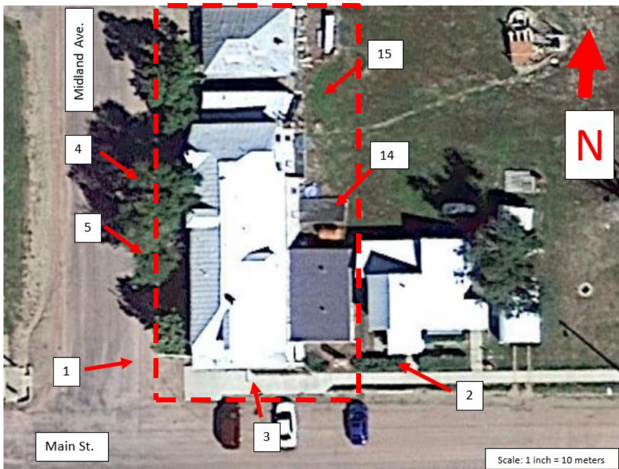
Photo Key Map. Exterior photos, 1-5 & 14-15.