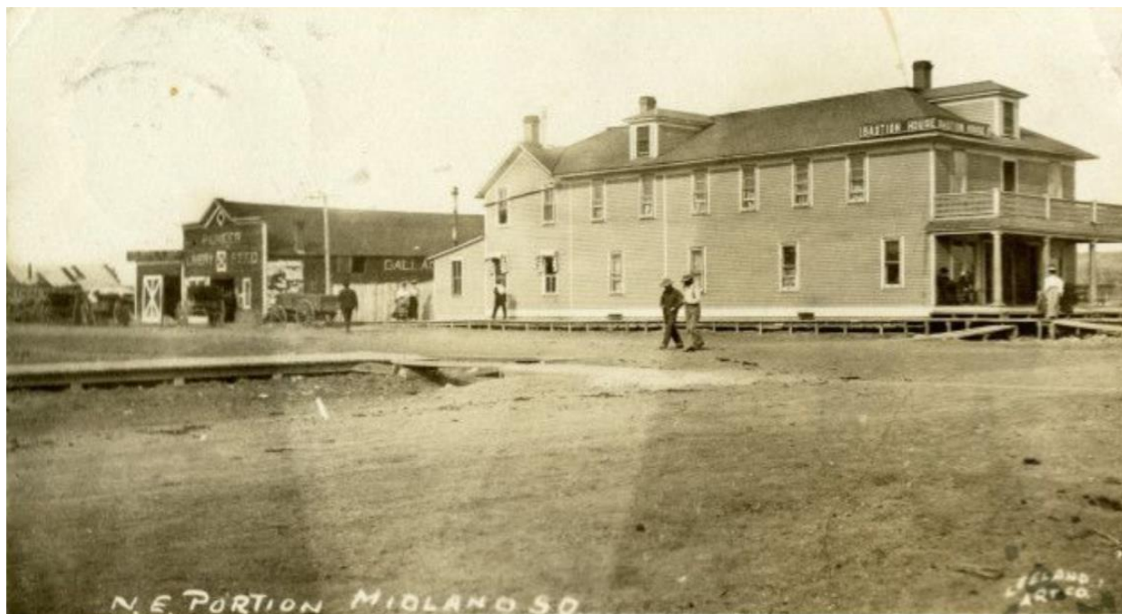
Bastion House, circa 1909.

In 1905, the Bastion Road House was built on the west side of Mitchell Creek in what was called "East Midland." Don Bastion constructed the 33-room structure to serve the stagecoach business that preceded the railroad. In 1907, the building was moved a few hundred meters west into the Midland townsite because its original location was too close to the railroad tracks. An addition was added after relocation, along with a raised, wooden sidewalk. The Bastions ran the boarding house until 1917, and from 1917 to 1937, it had several owners, operators, and lessees before closing during the Depression. 17