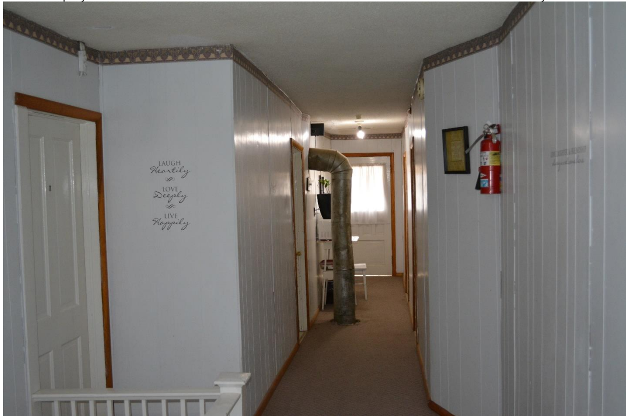
SD_HaakonCounty_StroppelHotelandHotMineralBaths_0012. Interior view of second-floor hallway.