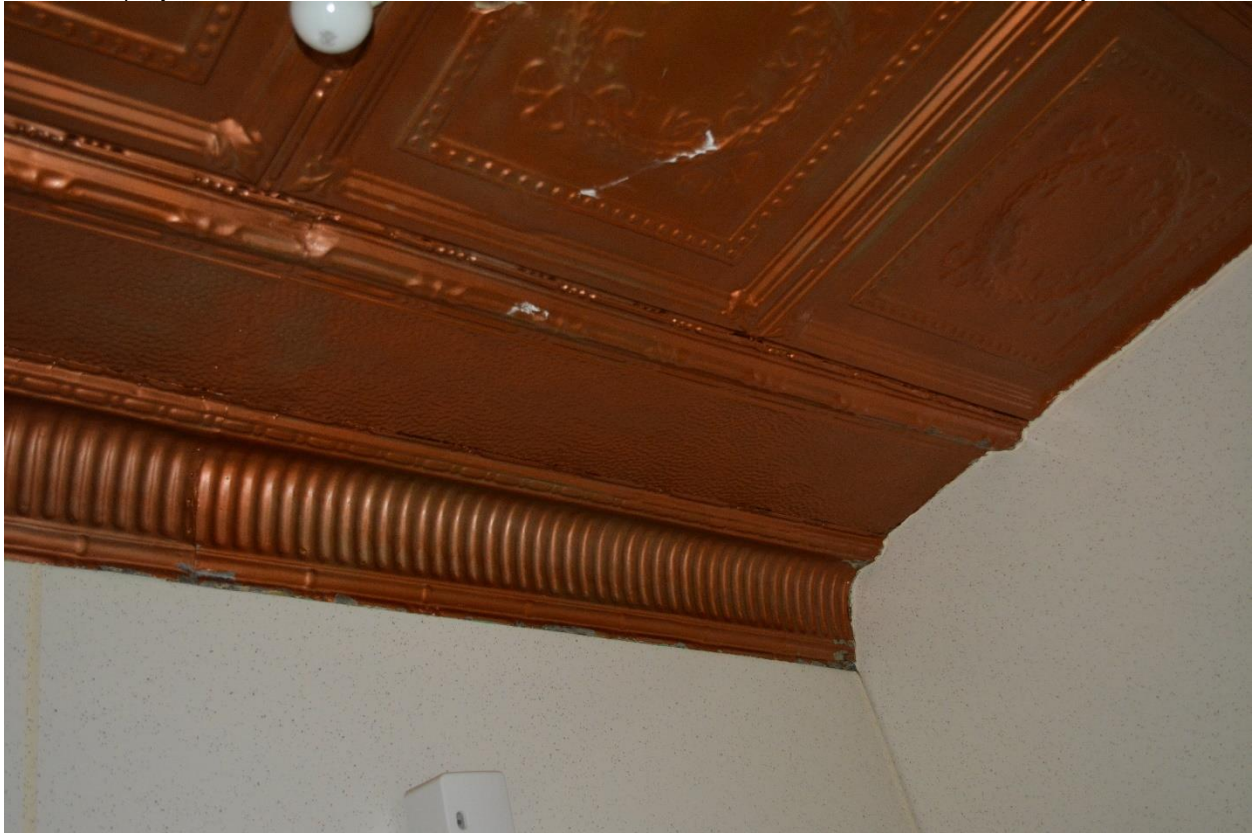
SD_HaakonCounty_StroppelHotelandHotMineralBaths_0009. Interior close up of tin ceiling.