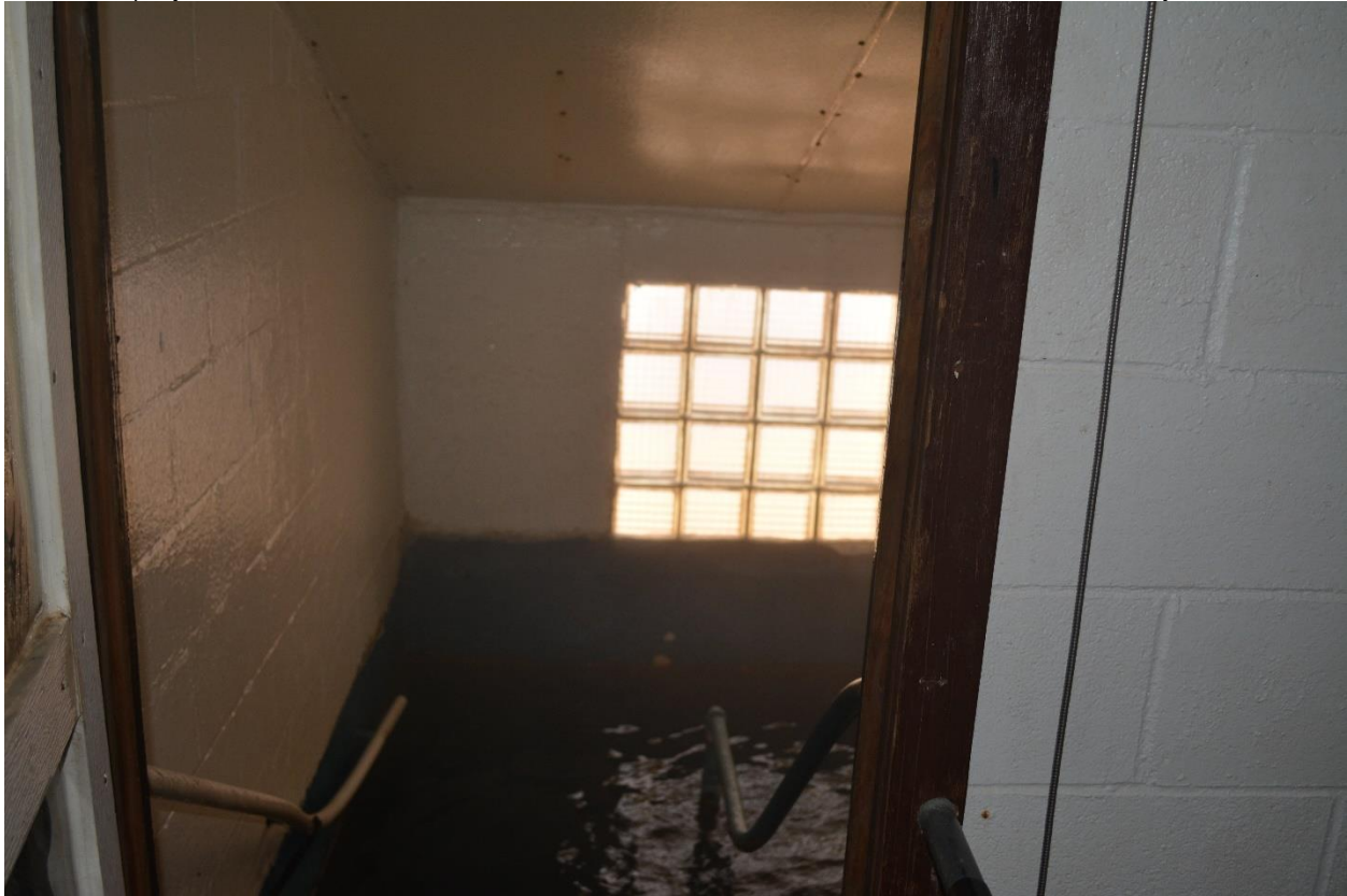
SD_HaakonCounty_StroppelHotelandHotMineralBaths_0007. Interior view of a plunge bath.