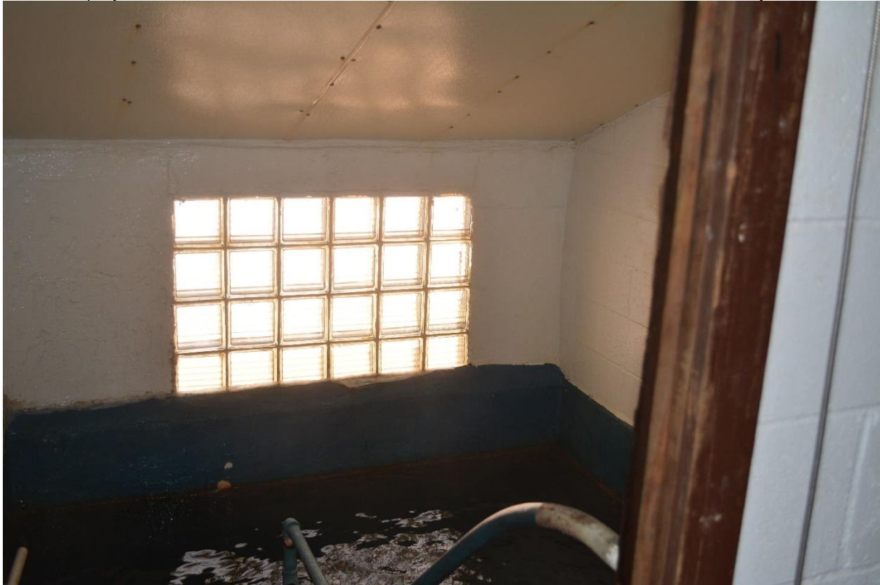
SD_HaakonCounty_StroppelHotelandHotMineralBaths_0006. Interior view of a plunge bath.