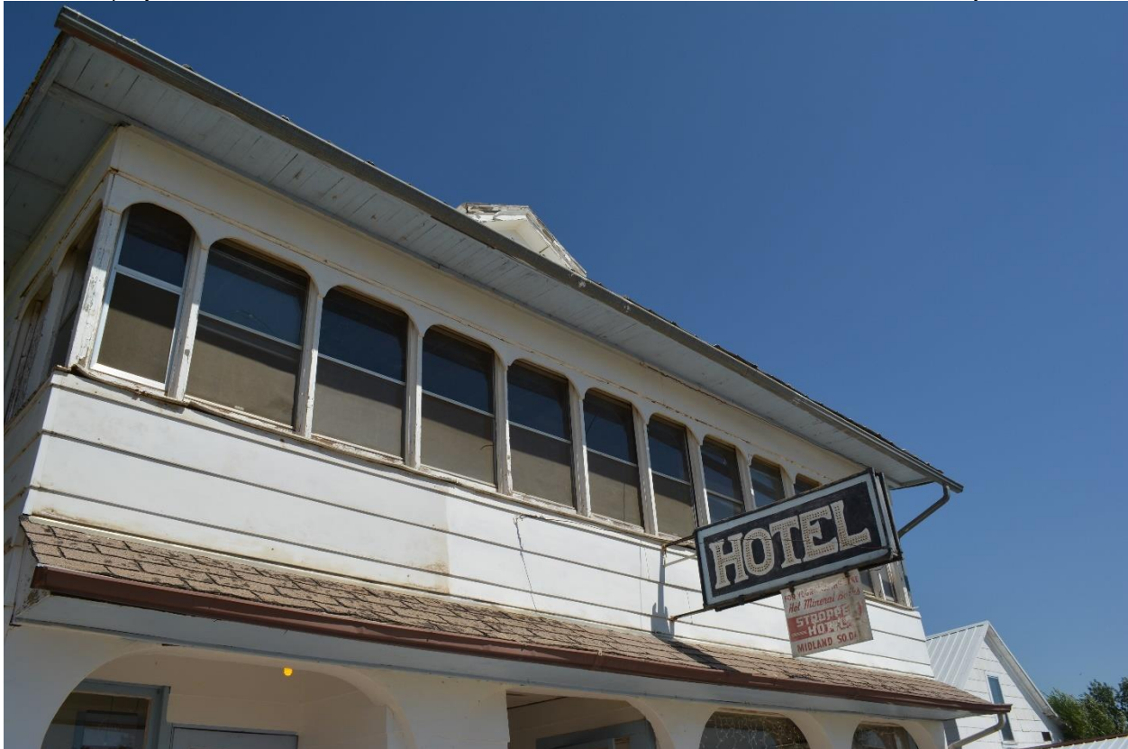
SD_HaakonCounty_StroppelHotelandHotMineralBaths_0003. Photo looking north at south elevation.