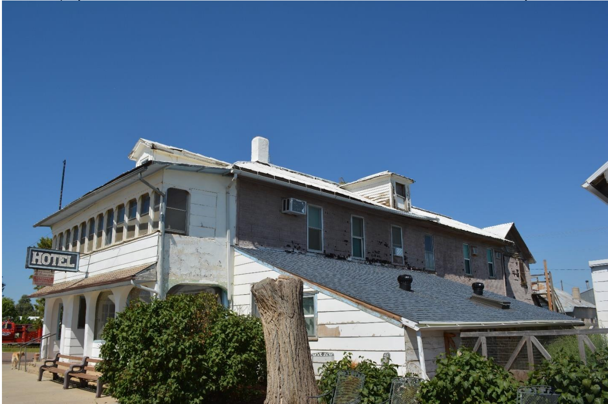
SD_HaakonCounty_StroppelHotelandHotMineralBaths_0002. Photo looking northwest at east and south elevations.