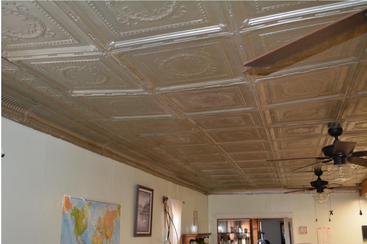
SD_HaakonCounty_StroppelHotelandHotMineralBaths_0008. First floor interior view.