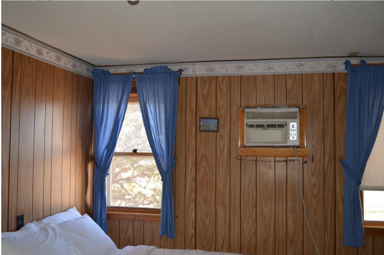
SD_HaakonCounty_StroppelHotelandHotMineralBaths_0011. Interior view of second-floor room.