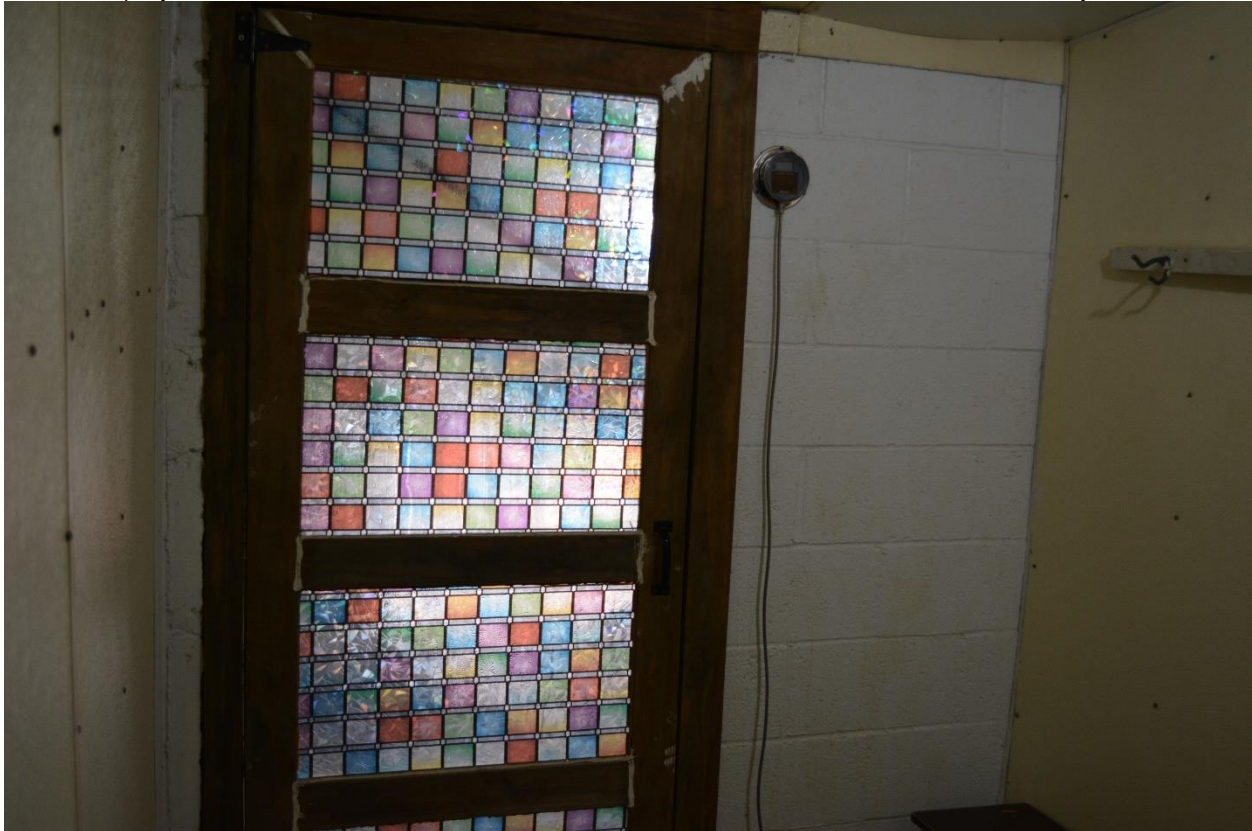
SD_HaakonCounty_StroppelHotelandHotMineralBaths_0013. Interior view of plunge bath door.