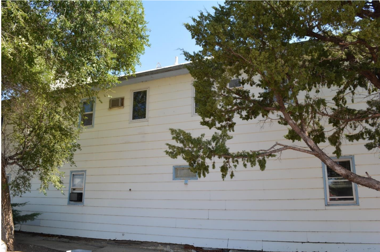
SD_HaakonCounty_StroppelHotelandHotMineralBaths_0005. Photo looking east at west elevation.