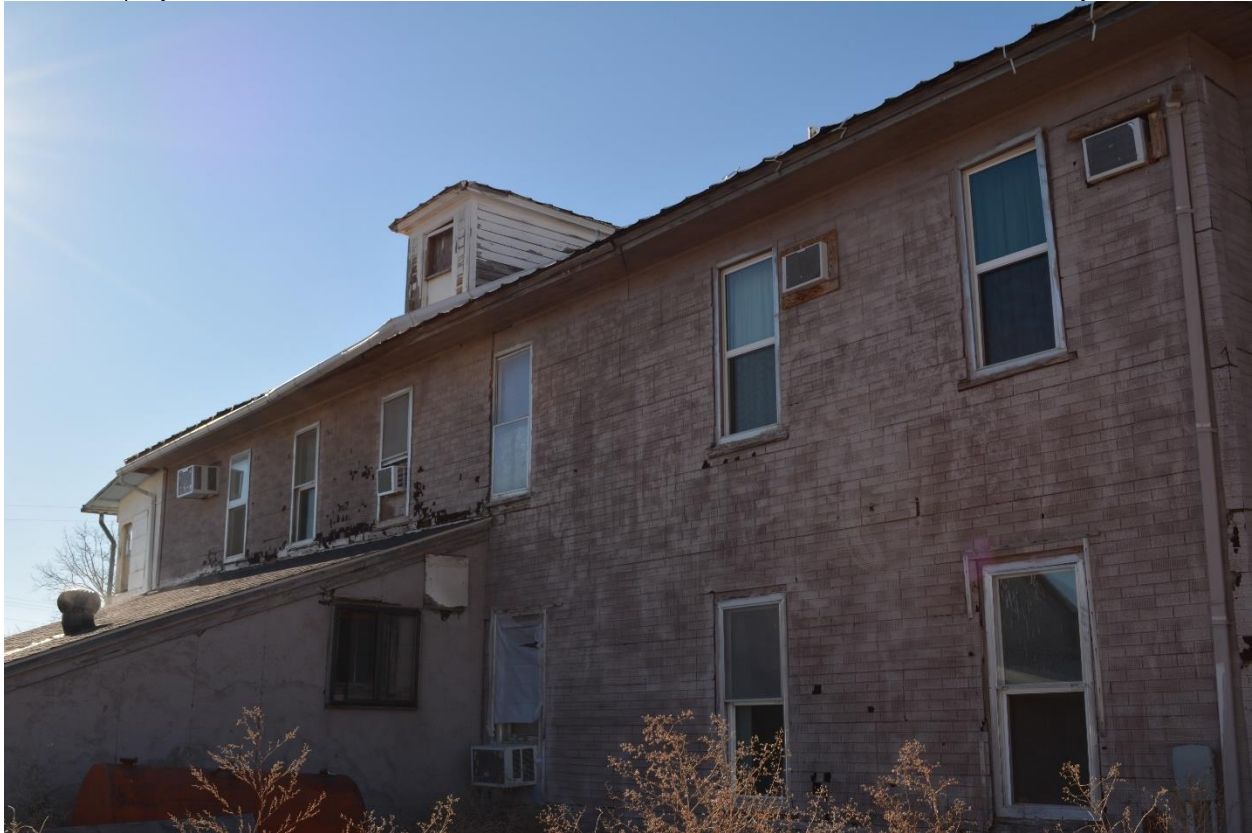
SD_HaakonCounty_StroppelHotelandHotMineralBaths_0014. Photo looking southwest at east elevation.