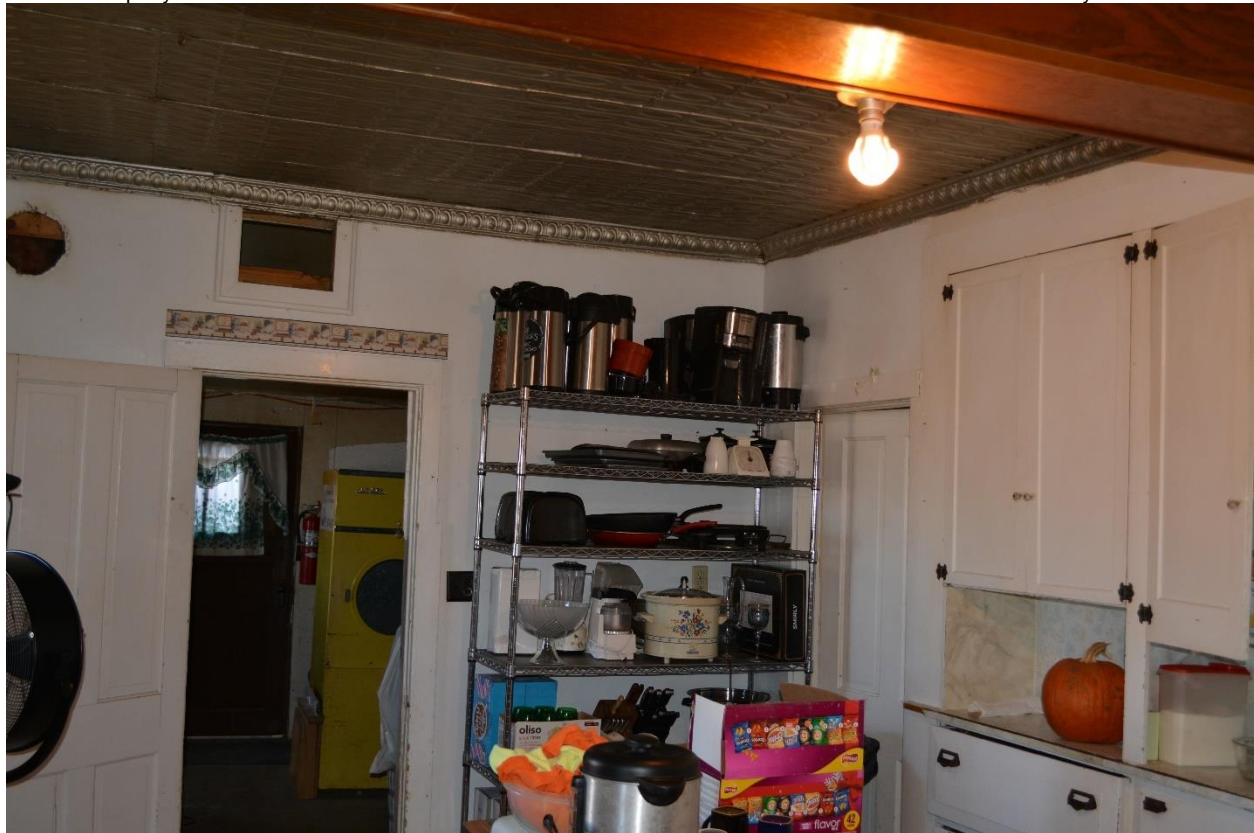
SD_HaakonCounty_StroppelHotelandHotMineralBaths_0010. Interior view of kitchen.