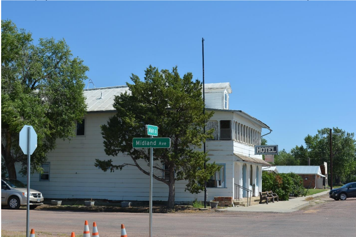
SD_HaakonCounty_StroppelHotelandHotMineralBaths_0001. Photo looking east at south and west elevations.