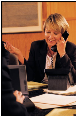
Benefits Specialists will follow along with participants in work incentives planning.