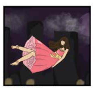
KILI COLE, 5th grade Free Falling Batesland Elementary, Summerset