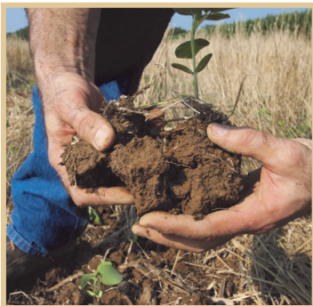
Soil health and cropland erosion control