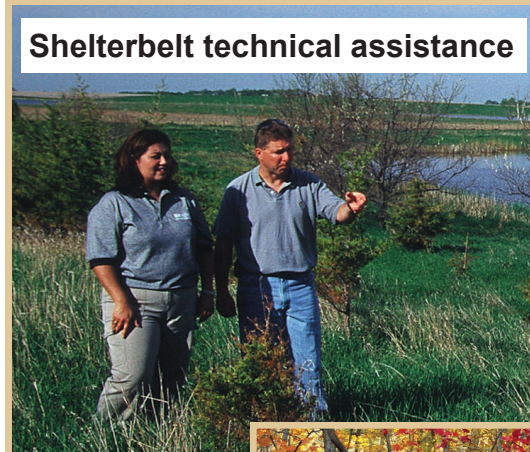
Shelterbelt technical assistance