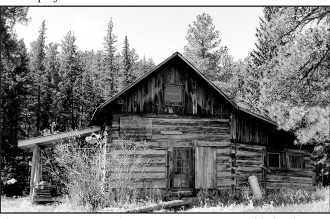
The Patterson Homestead in Lawrence County was added to the National Register of Historic Places in 2022.

The staff of eight preservationists continues to do outstanding work each and every day to make South Dakota's communities better. For more information about historic preservation programs, resources and activities, please visit history.sd.gov/Preservation/ or call (605) 773-3458.