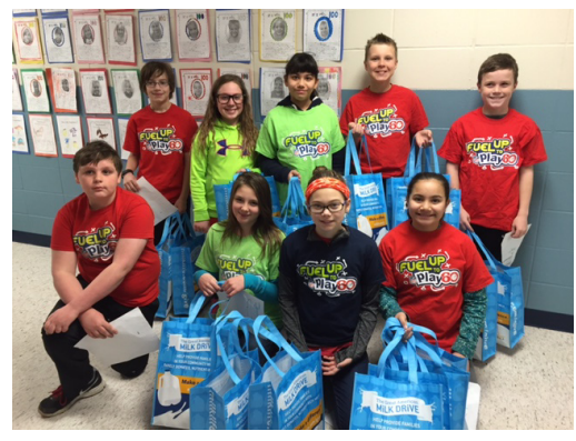
The student Wellness Council at Robert Frost Elementary works toward students choosing the right foods and getting regular physical activity.

At Knollwood Elementary and Black Hawk Elementary in Rapid City, nutrition lessons around dairy farming used Midwest Dairy's farm-to-school resources. And Georgia Morse Middle School in Pierre piloted a Grab-and-Go to the Classroom breakfast program with grant funds from Midwest Dairy Council. Since each school breakfast served includes milk, and often cheese or yogurt, breakfast program expansion is a priority for Midwest Dairy.