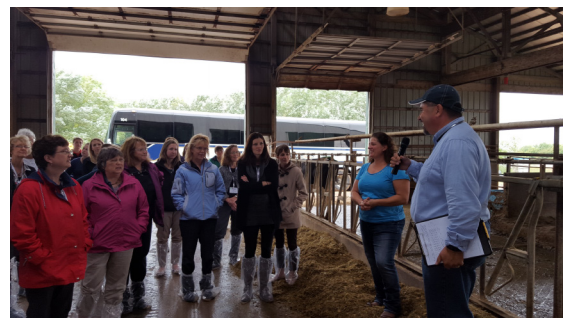
Registered dietitians visit with a cow nutritionist – same work, different clients.

Midwest Dairy helps to broaden consumer confidence in dairy through its work with various health professional and food leadership groups across South Dakota. Among the activities was a "VIP Thought Leader" tour at Boadwine Dairy in Baltic. The group saw firsthand how milk goes from farm to table, also receiving a tour of Dean Foods.