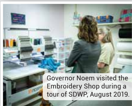
Governor Noem visited the Embroidery Shop during a tour of SDWP, August 2019.