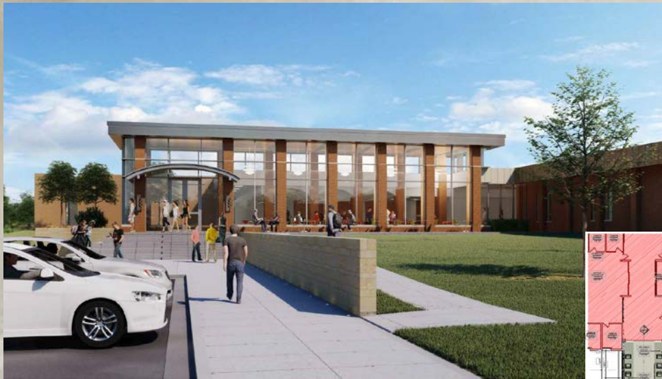
CO-OP Architects & Mills Construction Ground Breaking – Spring 2019

Thank you to Prairie Lakes Healthcare System, Health and Education Facilities Authority, State Board of Technical Education, Legislature, and Governor for making this critical expansion possible.