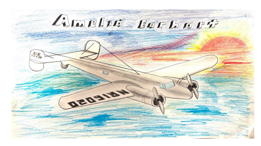
2<sup>nd</sup> Place Tommy, age 14 New Underwood