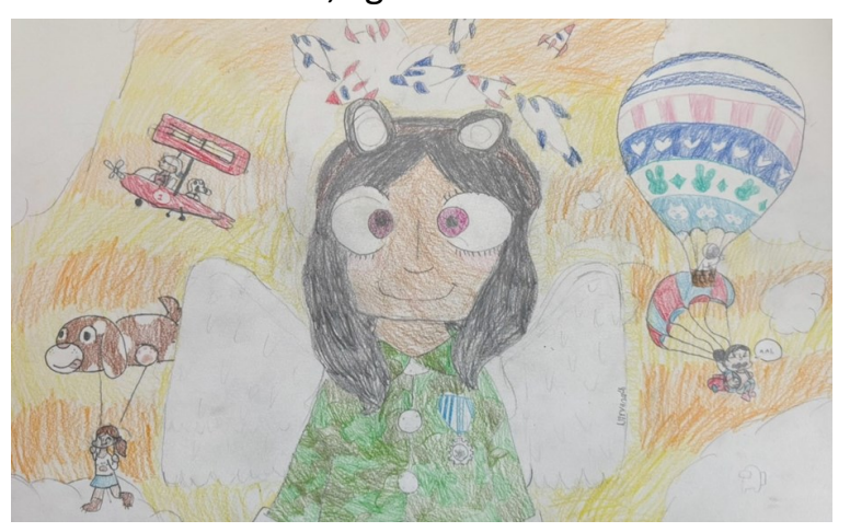
Natalie Volmer, age 13 - New Underwood