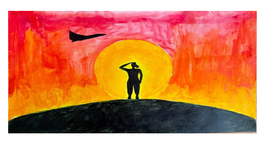
3<sup>rd</sup> place Lily, age 14 New Underwood