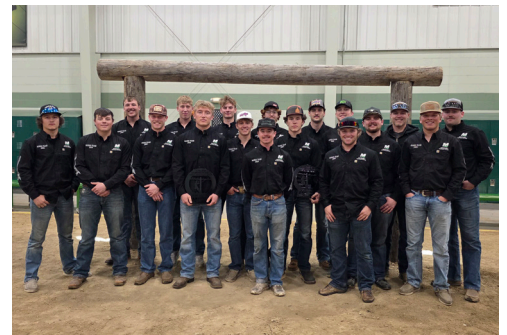
Mitchell Tech had 20 students represent our Power Line program at the Lineman Rodeo. Five of those students earned a total of eight top finishes across multiple events.

Mitchell Tech students earned eight top finishes across multiple events, further demonstrating the strength of the program and the level of preparation students receive.