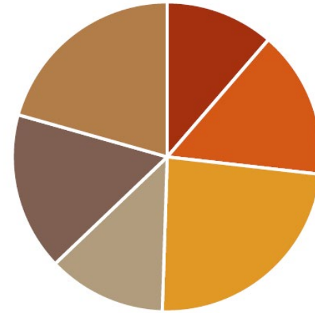
Participation by CTE Region