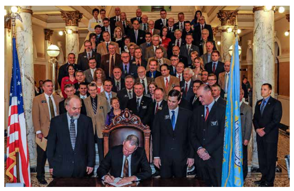
Gov. Dennis Daugaard signs the Public Safety Improvement Act into law Feb. 6, 2013.